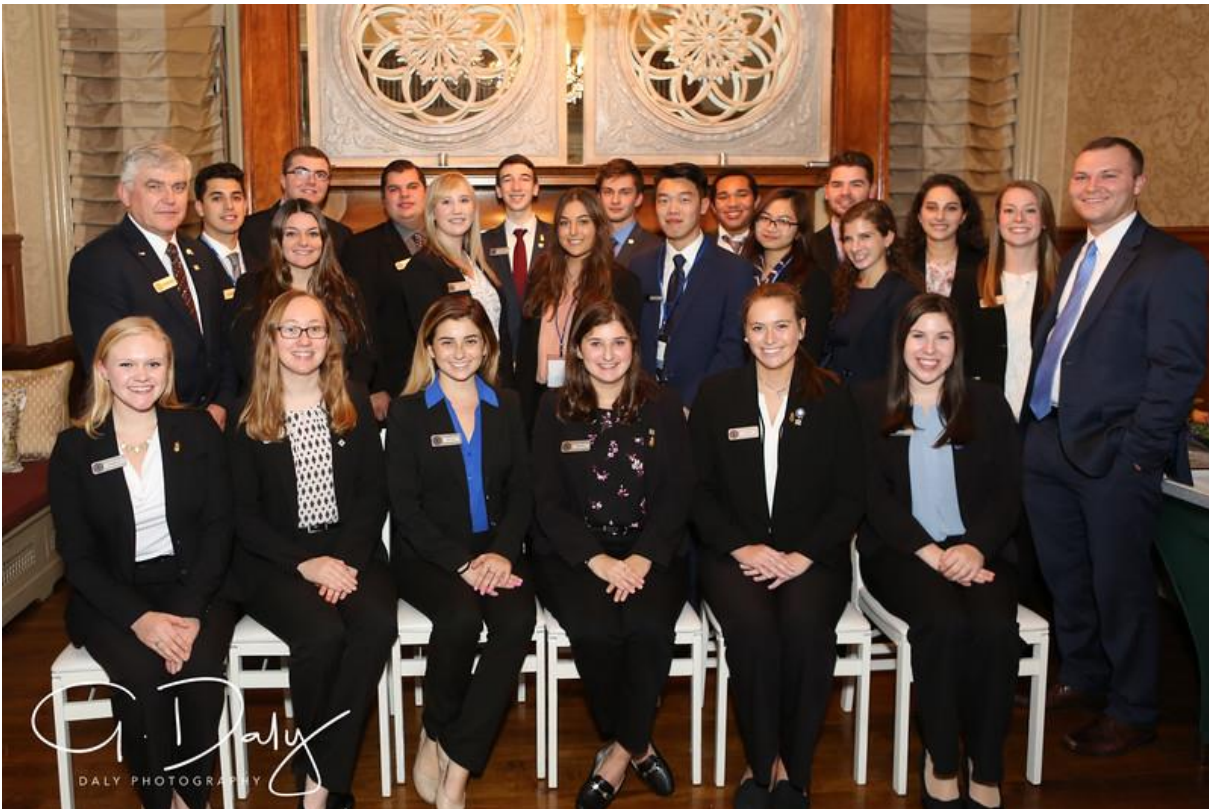
UMass Student Chapter of CMAA, Worcester Country Club, NECMA Annual Meeting & Scholarship Dinner 2018-2019