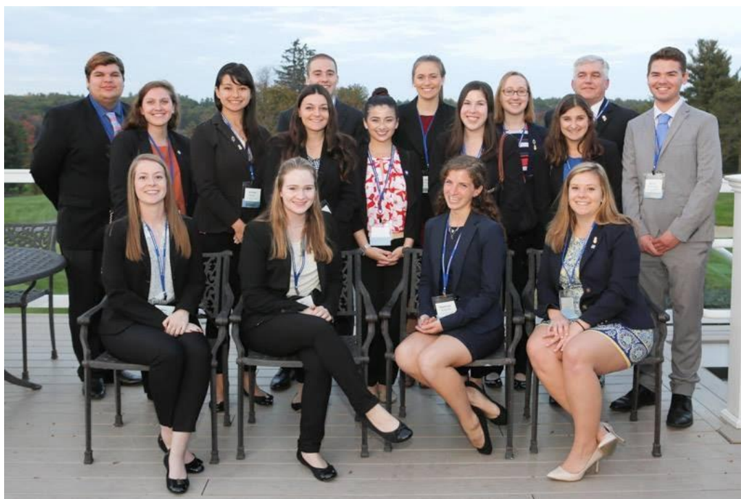
2017-2018 UMass CMAA Student Chapter at Haverhill Country Club in Massachusetts for NECMA Annual Meeting.